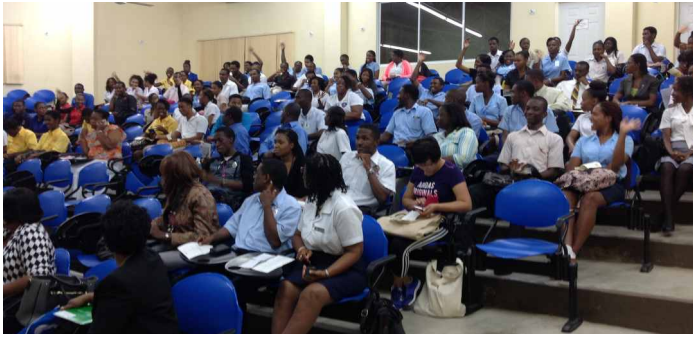
Students raise their hands in response to a question from the panel during the Students' Forum at the Montego Bay Community College.