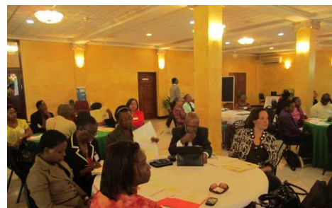
Delegates get down to work at the workshop for institutions.