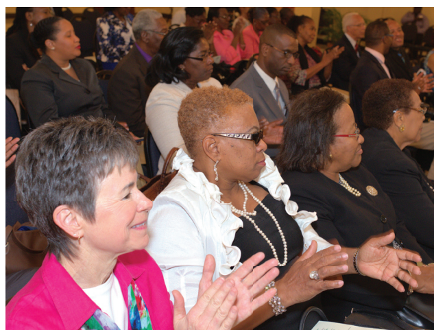
Representatives from tertiary institutions at the UCJ Awards Ceremony.

Representatives from the Jamaican tertiary education community were on hand at the Mona Visitors' Lodge and Conference Centre, on Thursday, March 10, 2016, to witness the UCJ present the first ever Certificates of Programme Recognition to overseas-based, Walden University.