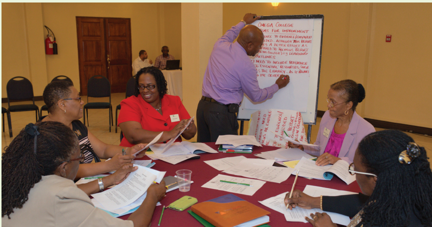
Participants at the UCJ Workshop for Assessors and Accreditation Officers engaging in a group activity.