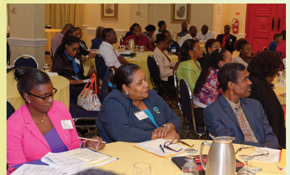
Representatives from tertiary institutions participating in the discussions.